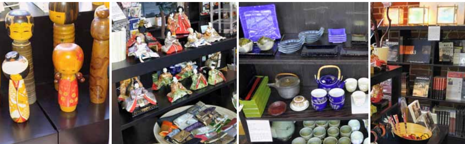
These are a few of the treasures you can find at our PopUp shop, Omiyage!