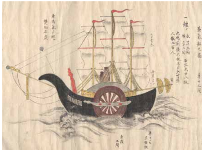
This rare treasure, a depiction of the 1853 Perry Expedition to Japan, was donated to ONLC.