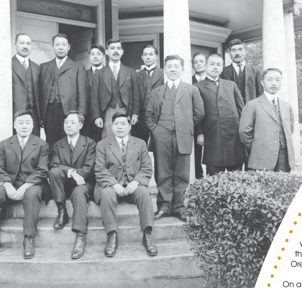
Leaders of Portland's Japanese community welcome Consul-General of Japan Yosuke Matsuoka on his way from New York to Tokyo. This photo was taken on June 20, 1916, possibly at the residence of the Portland Consul-General.